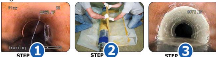
Locate the leak using sewer camera.

So how does Pipe Patch work? It utilizes a two part epoxy resin, a fiberglass mat, a flow-thru pneumatic plug, (known as a packer), and air to inflate the plug. The resin is spread over the mat. The epoxy-saturated fiberglass mat is wrapped around the flow-thru plug, inserted into the sewer line and pulled into place by rope. The plug is then inflated by an air compressor and the repair is under way. It works much like a stint in the artery of a human, adding support to the wall of the pipe from the interior and sealing off joints and cracks from roots and groundwater intrusion.