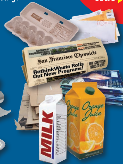
Paper, Cardboard, Milk & Juice Cartons, Paper Egg Cartons, Newspaper, Magazines, Junk Mail