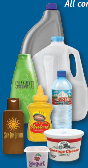
Plastic Containers Numbered ♻️ 1-7

All containers must be empty. Rinsing not necessary.