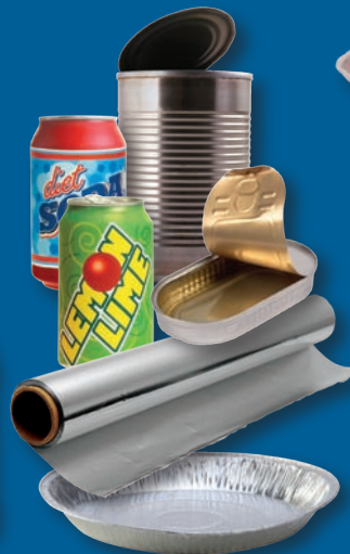
Metal Cans, Aluminum Foil, Small Scrap Metal